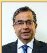
Prof. K. Srinath Reddy

The e-Resource Centre for Tobacco Control is a very valuable asset from which tobacco control researchers, advocates and policy makers can draw updated information and documentary resources to support and guide their work. It is the beating heart of the tobacco control movement in India.