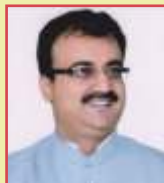
Shri Mangal Pandey

The E-Resource Centre for Tobacco Control (ERCTC), an initiative by Post Graduate Institute of Medical Education & Research (PGIMER) Chandigarh provides all relevant information related to tobacco control under one roof. The E-RCTC showcases a repository of latest orders, circulars, notifications & many others that are being released from time to time both by the state and central governments to curb the tobacco menace. The E-RCTC would also help counter the misleading facts on tobacco control which exist on various web engines.