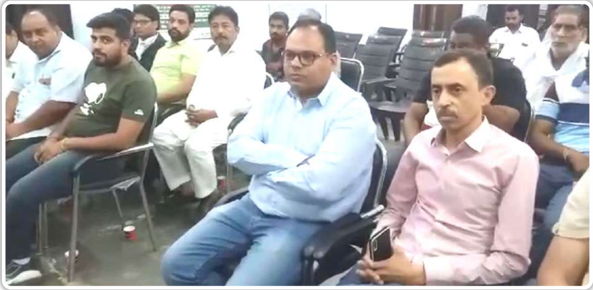
• Meeting with Tobacco vendors