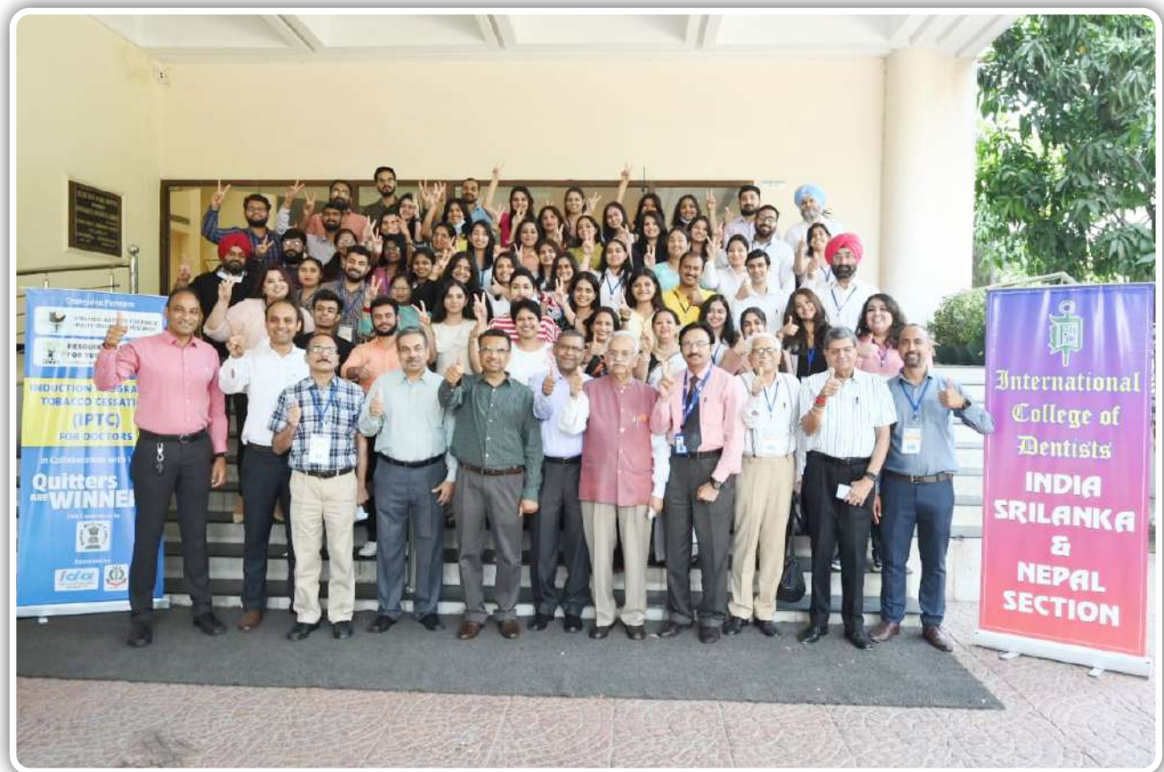
IPTC (Induction Program in Tobacco Cessation) Pictures